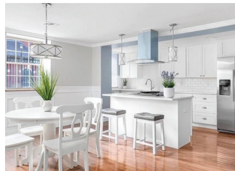
7 Mt. Hope Ave., East Side 24 Unit New Construction condos all sold by Debbie Gold.